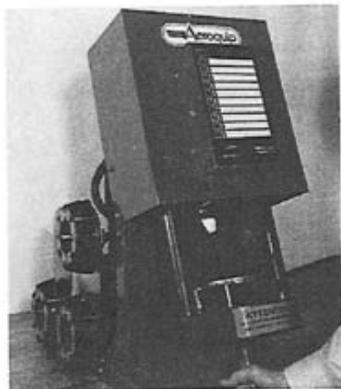
Aeroquip offers a complete line of high quality hose crimp machines to meet all your hose assembly needs.