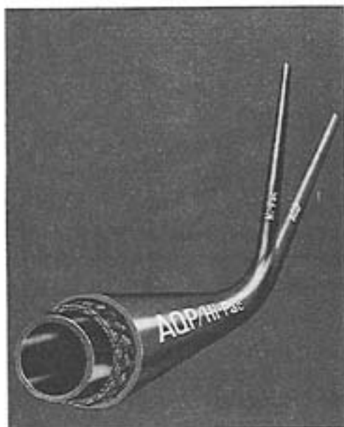
Aeroquip Hi-Pac Hose is available in synthetic rubber and AQP ® constructions.

Designed for Easier Installation, Less Weight and More Versatility